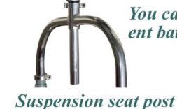
Suspension seat post