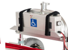
Auxiliary Battery Tray