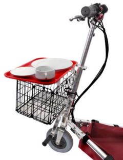
Cruise ship set